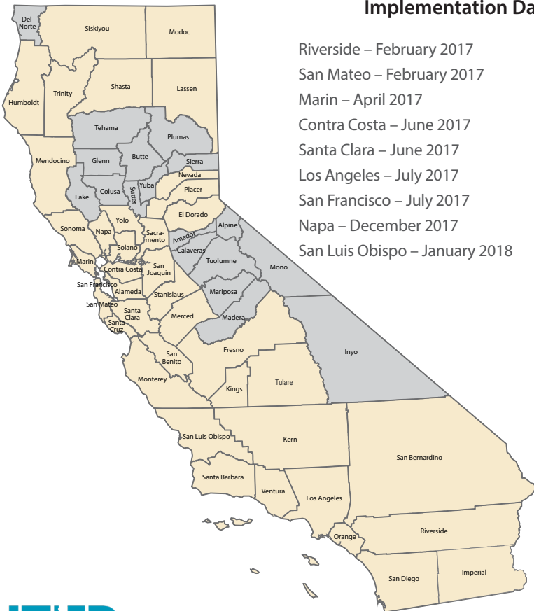
Figure 4. 2020 Waiver: Drug Medi-Cal Organized Delivery System (DMC-ODS) 6 Implementation Dates by County