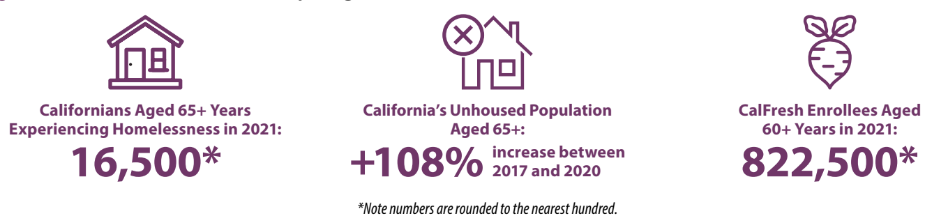
Figure 5: Social Drivers of Health (SDoH) Impacting Older Adults<sup>5,6,7</sup>